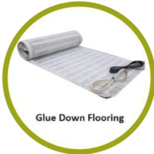
Glue Down Flooring