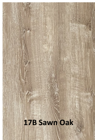
17B Sawn Oak