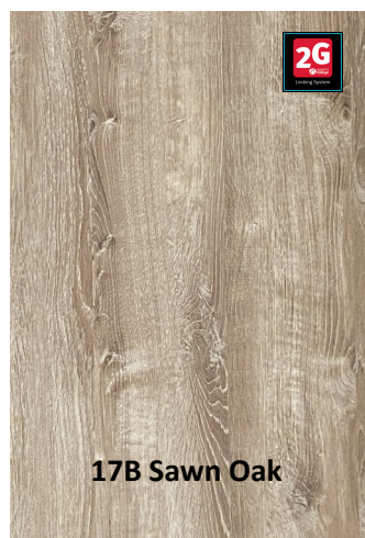
17B Sawn Oak